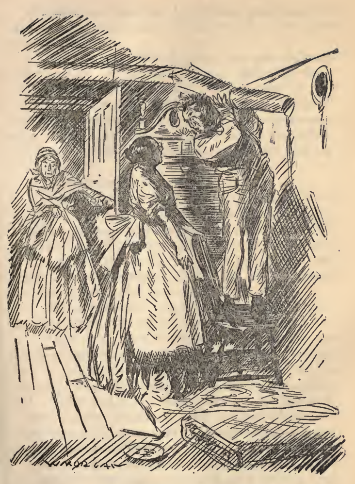
"You sassy - Get down off that chair and out of this house!"